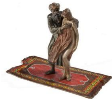
A fine erotic cold painted bronze by Franz Xavier Bergman, with hinged arm, c1910, £3,750 from T Robert