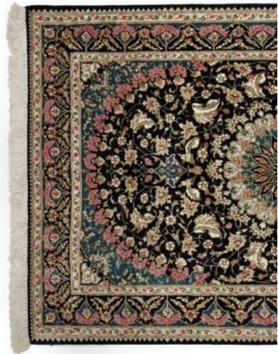
Hand woven silk Qum (detail), £3,900 from M&N Oriental Rugs