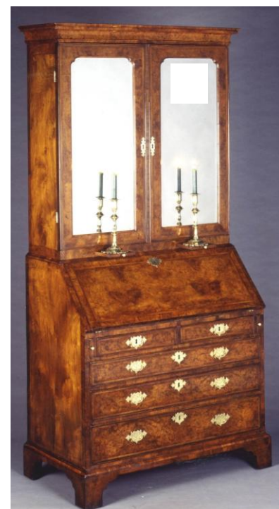
George I period burr walnut bureau bookcase, c 1720, £95,000 from WR Harvey & Co (Antiques) Ltd.