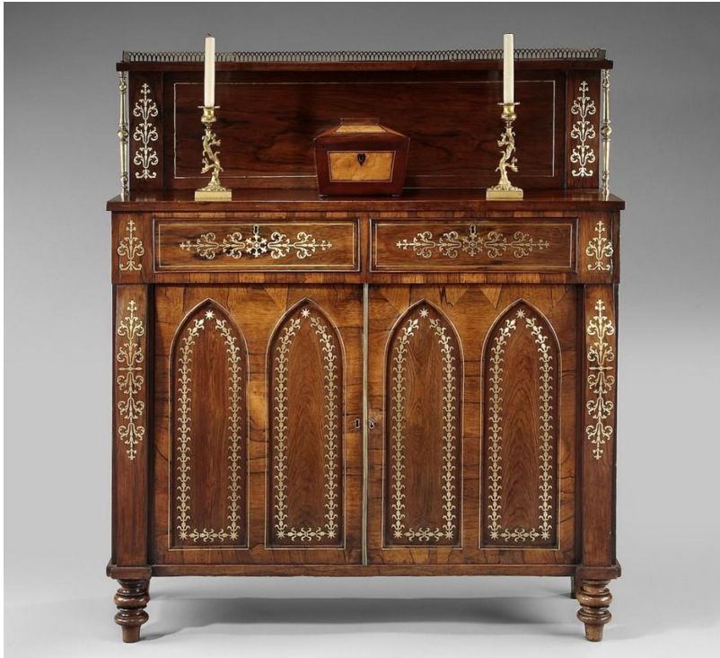
Rosewood and brass inlaid Regency chiffonier, c1820, £7,750 from Arkell Antiques of Dorking