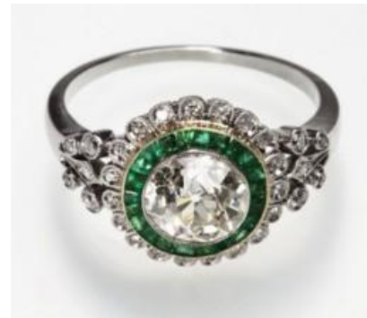
Emerald, diamond and platinum target ring, £5,500 from Plaza

The Esher Hall Antiques and Fine Art Fair 8 – 10 October 2010